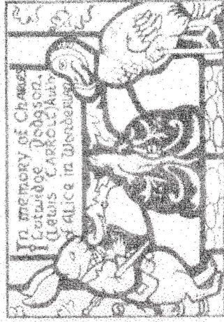
Panel from Lewis Carroll window